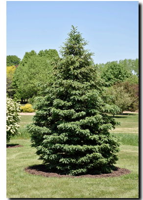
Black Hills Spruce

The trees will have to be dug and installed after August. The cost to dig, ship, plant and stake two trees with a one year guarantee is $3800 . As soon as we've raised the funds, the Tree Board will finalize the purchase and plans for a late summer/fall installation.