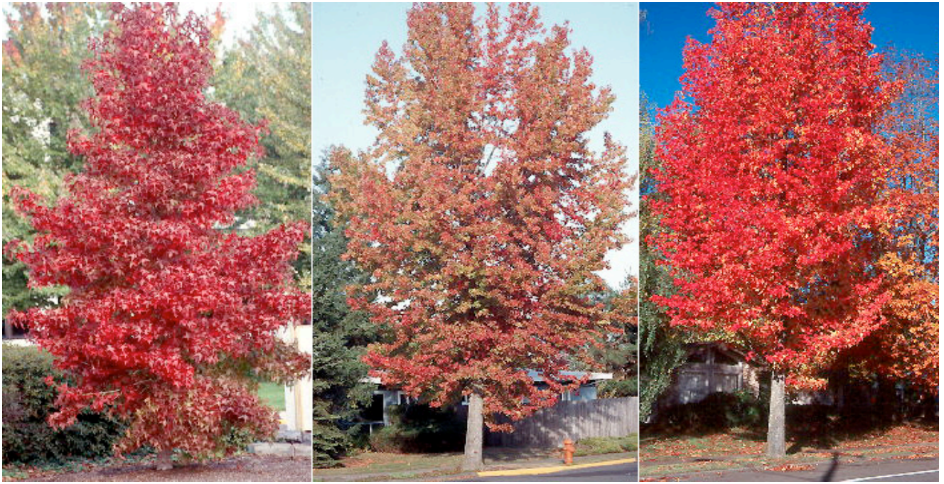
American Sweetgum