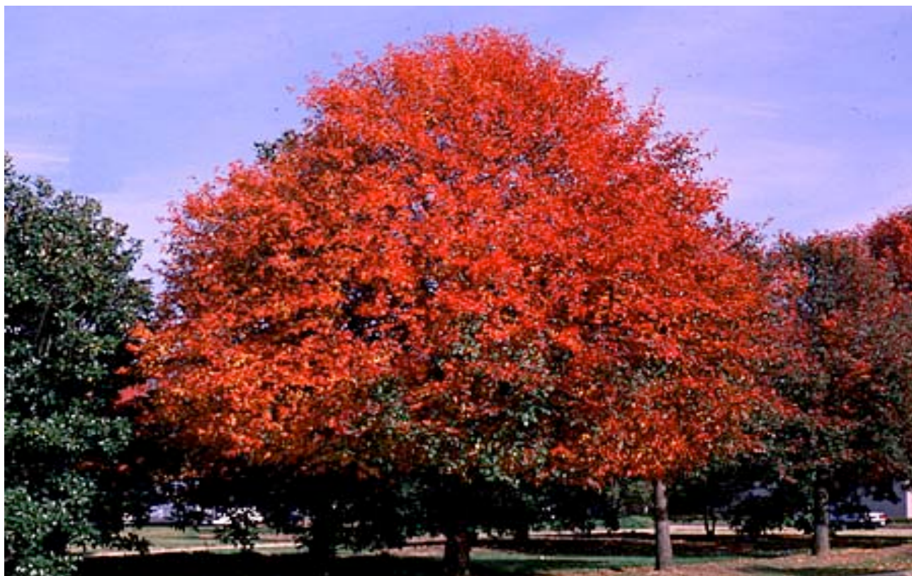
Black Gum

Another beautiful tree with show-stopping fall color is the Black Gum, also known as Tupelo or Sour Gum. Black Gum is also considered a medium to large tree, so it cannot be planted under utility wires. It may grow to a height of 40' with a spread of 30'. In the wild they can grow much larger. It also is a good all-around tree that will thrive in most conditions. It is pyramidal while young, but matures to irregular round or oval when mature. The growth rate is considered slow to medium, but with proper care can be faster. Leaves are smaller oval shaped, glossy green, and turn bright red in fall. The glossy red fall color is magnificent. This is a tree that should be planted more often.