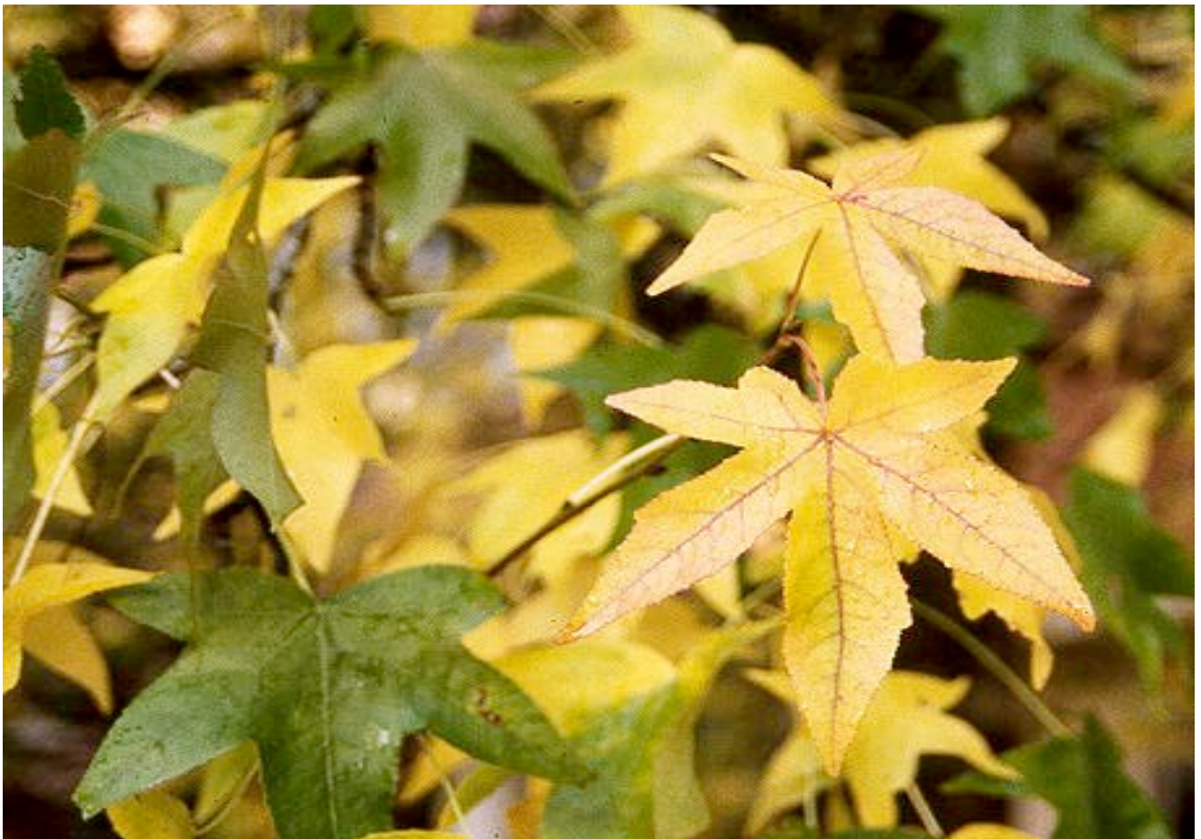
American Sweetgum